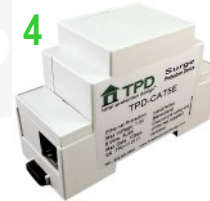
Model # TPD-CAT6