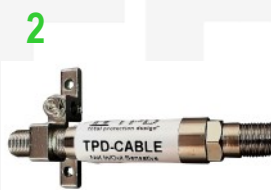
Model # TPD-CABLE