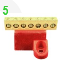
Model # TPD-GRD-7

Need additional assistance? Call Technical Support 1-888-281-7856 info@TPDSurge.com www.TransientProtectionDesign.com